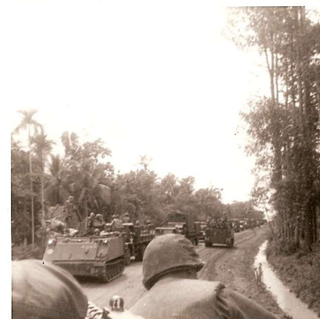
A Co. going out as another company escorts a convoy in.jpg (670x670)