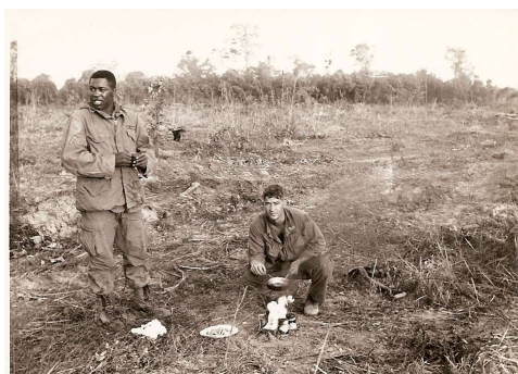
Me and a member of my squad (name unknown) believed to be a KIA.jpg (960x684)