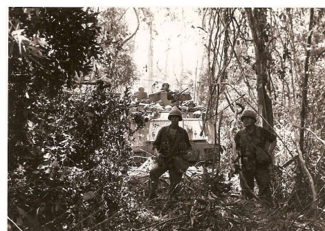
A22 in heavy cover on Operation Yellowstone.jpg (956x664)