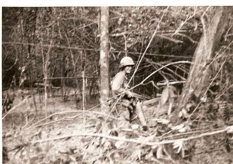
Me entering a VC basecamp on a Search and Destroy.jpg (956x666)