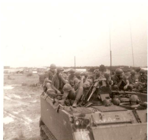
A Company heading for the field. (Squad unknown).jpg (650x618)