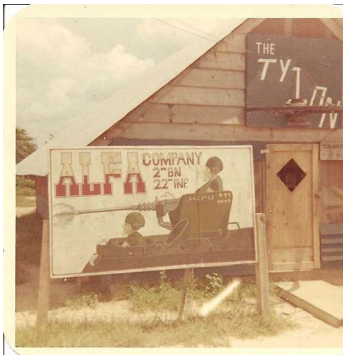
Alpha Company's Clubhouse -Ty 1 On Club.jpg (576x600)