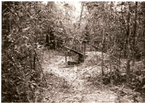
VC bunker.jpg (600x412)