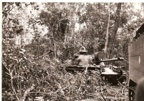
Armor Support-Operation Yellowstone 1967.jpg (600x412)