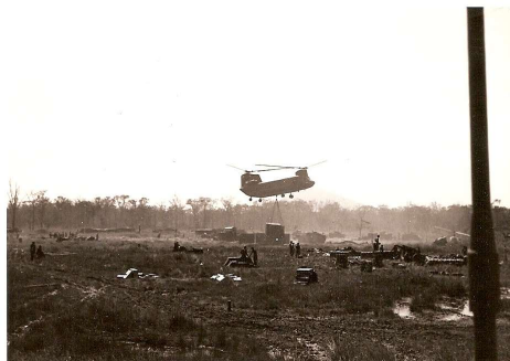
A 22 supplies being brought in on a Snook.jpg (966x690)