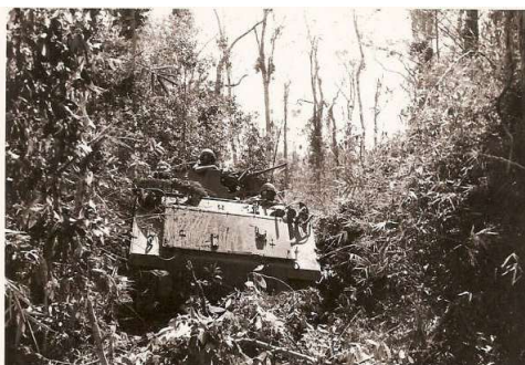
Alpha Company, Operation Yellowstone 1967.jpg (600x408)