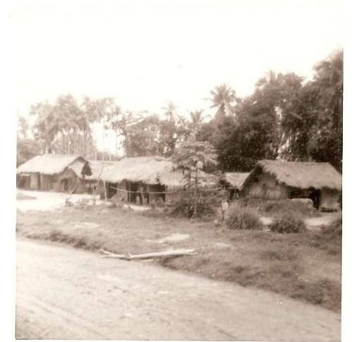
Vietnamese Village.jpg (652x662)