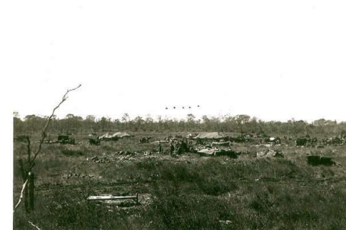
Helicopter Troops support units, Division base camp.jpg (600x396)