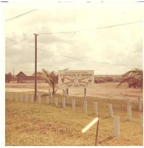
2nd Battalion 22nd Infantry Headquarters sign.jpg (470x480)