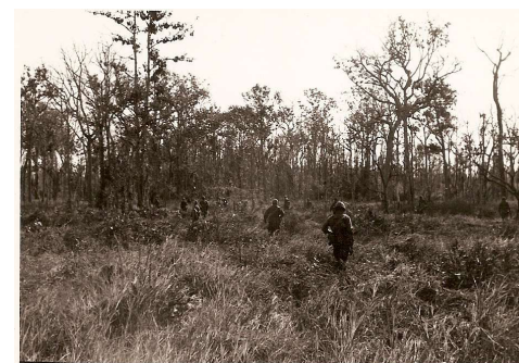
Alpha Company on a foot patrol.jpg (958x664)