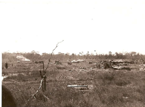
A 22 basecamp, Operation Yellowstone. jpg (968x692)