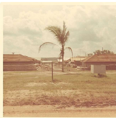
A22 Company Barracks 1967-68.jpg (668x658)